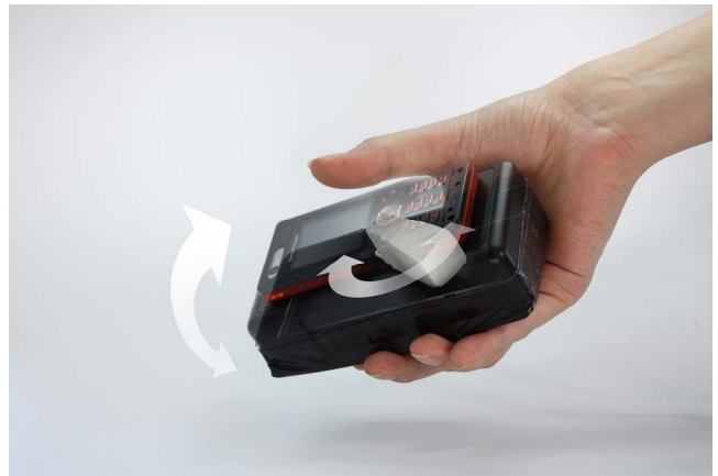
Figure 1. Prototype, consisting of mobile phone, weight-actuated box and accelerometer.

The proposed applications make use of buttons, internal processes, or external data as input – but none of them draws on the device's motion. However, taking motion and tilt into account as an input seems promising. This paper will review related literature, describe the proposed system, report a conducted user study, and discuss its implications for research in this field.