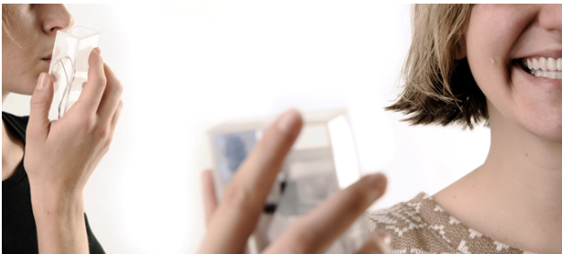
Figure 2: Kissing prototype, kissing telecommunication through wetness sensing and actuation on front side.

The majority of projects found in our literature review draws on symbolic mappings : Strong and Gaver’s objects make use of subtle cues like airborne feathers and scents to symbolize one user thinking of the other [15]. IDEO’s Kiss Communicator, through which users were able to ‘blow’ a kiss over a distance, for instance, maps kisses to LED lighting. Further early proposals in this area include IDEO’s Social Mobiles [1], mapping sounds to electric shocks, and the ComTouch project [4], mapping pressure to vibration. These projects were followed by proposals for everyday integration in long-distance relationships, like the Lover’s Cups [5], which symbolize drinking through lit LEDs.