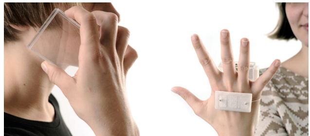
Figure 1: Grasping prototype, grasping telecommunication through pressure sensing and tightness actuation.

MobileHCI 2011 , Aug 30–Sept 2, 2011, Stockholm, Sweden. Copyright 2011 ACM 978-1-4503-0541-9/11/08-09...$10.00.