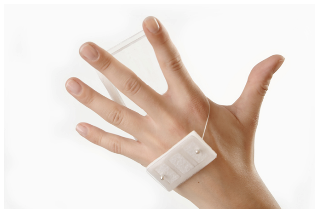
Figure 4: Grasping prototype, actuated hand loop.

Firstly, we propose a system for simulated grasp that reacts to pressure on one phone (Figure 1), and contracts a loop around the user’s hand on the other (Figure 4).